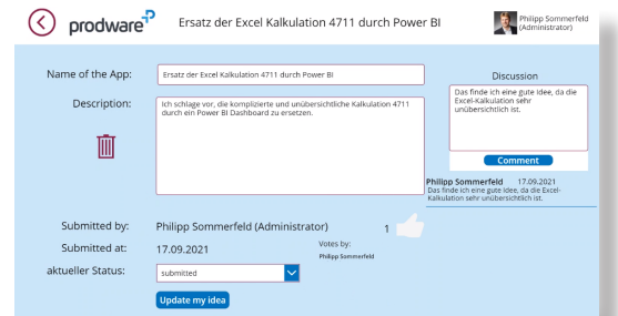
Comment and like function

The “Ideas@Prodware” Power App provides your employees with a platform in which they can intuitively record all types of ideas and suggestions for improvement via mobile devices or on the desktop PC. All ideas are clearly listed and can be commented on and rated by all employees in the company (like function).